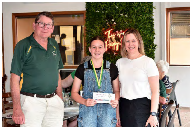
Our last recipient

Unfortunately, due to lack of interest in nominating candidates we have decided to cease this program.